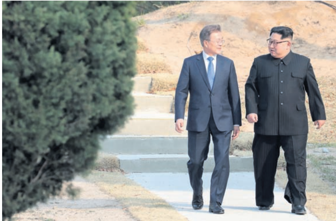
In this April 27, 2018 file photo, North Korean leader Kim Jong Un, right, and South Korean President Moon Jae-in stroll together at the border village of Panmunjom in the Demilitarized Zone, South Korea.